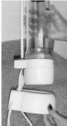
Figure 6 Separating stand from unit

⚠ The Sterilight unit generates ozone from surrounding air. Locate the unit in an area where the air is breathable and free from dust or fumes. The unit MUST be mounted vertically, with the filter at the TOP of the unit.